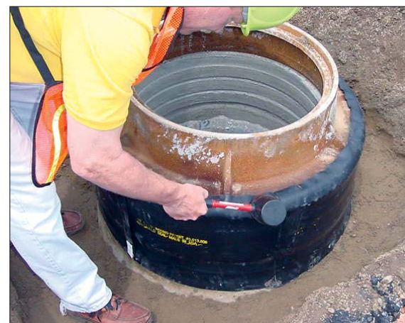
This sequence shows the application of an external rubber manhole seal. From left, the surface is prepared, the seal is pulled into place, and the seal is tapped into final position with a hammer.