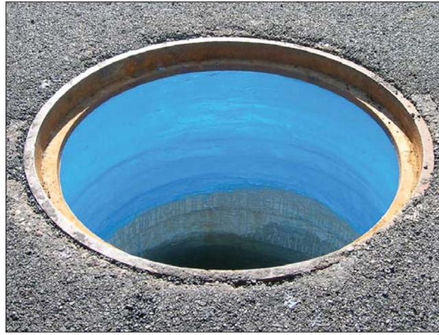
A urethane internal seal is applied to a manhole chimney. The finished project is at the right.

All three sources of infiltration in the manhole chimney area lend themselves to affordable corrective action.